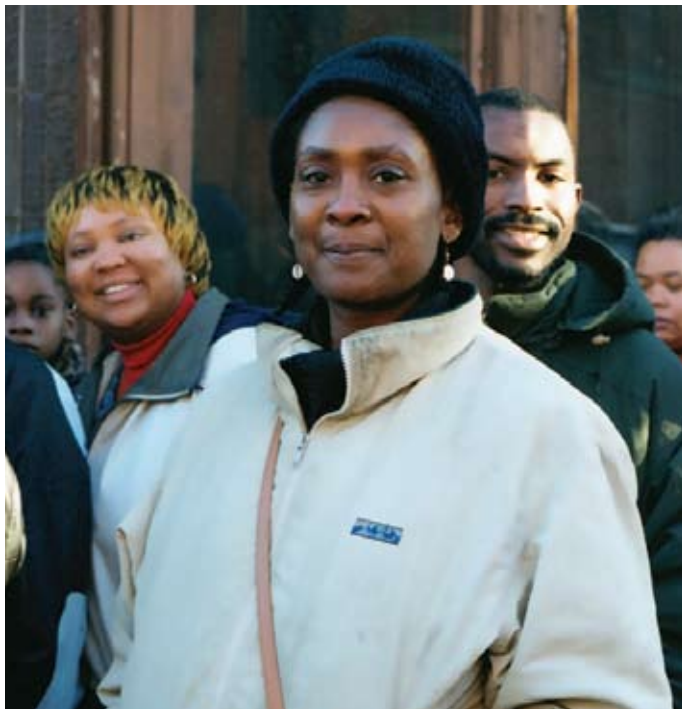
FIGURE 2. The Ohio Benefit Bank Partners